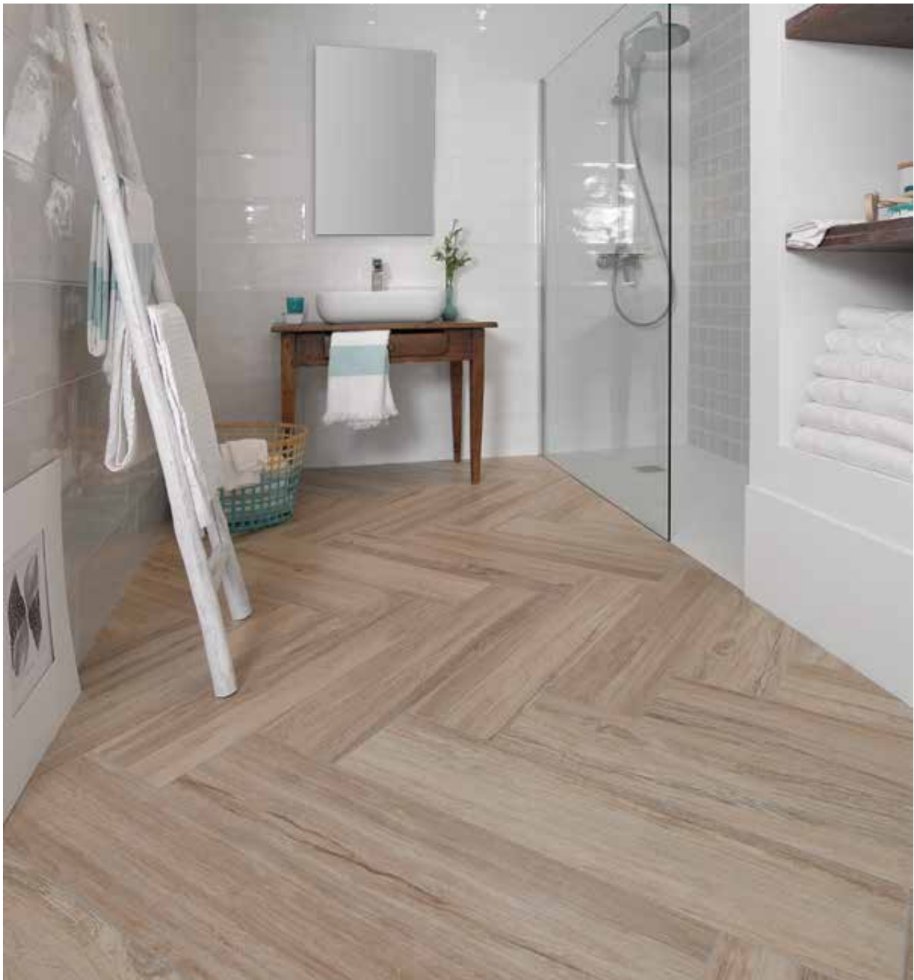
Sequoia Fresno 19,5x84 / Arlette Blanco 21,4x61 / Mosaico Arlette Gris 21,4x61